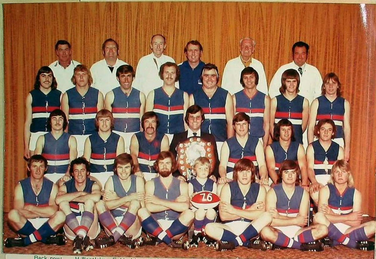
WALLAROO FOOTBALL CLUB PREMIERS "A" GRADE YORKE VALLEY FOOTBALL LEAGUE 1976